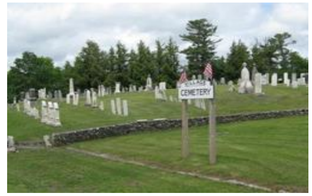
From the Town Hall parking lot, turn left onto Route 23, proceed for 0.1 miles, the cemetery is on your right.